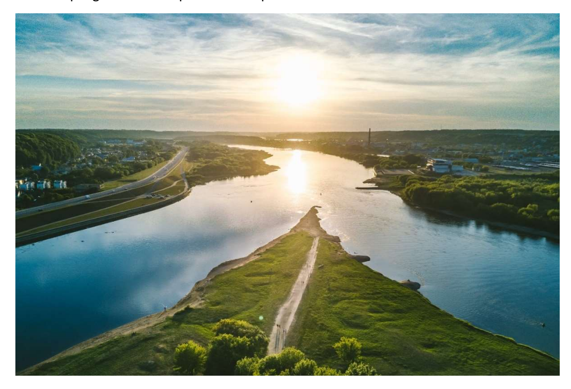
Confluence Engineering Solutions, Inc. -11

Bacteriological Sample Siting Plan - ConfluenceES developed an updated Bacteriological Sample Siting Plan (BSSP) to assist the City with maintaining compliance with Division of Drinking Water regulations and to ensure the safety of the distribution system water quality. The BSSP includes locations and frequency information for routine and repeat bacteriological water quality samples, including upstream/downstream sample locations. The upstream/downstream sample locations are used to determine if the original sample was positive due to operator or other error or if there is a larger bacteriological contamination issue. The plan additionally includes water system information, sample collection information, sampling frequency, and maps of the system which identify sample locations and additional resampling locations required after a positive coliform result.