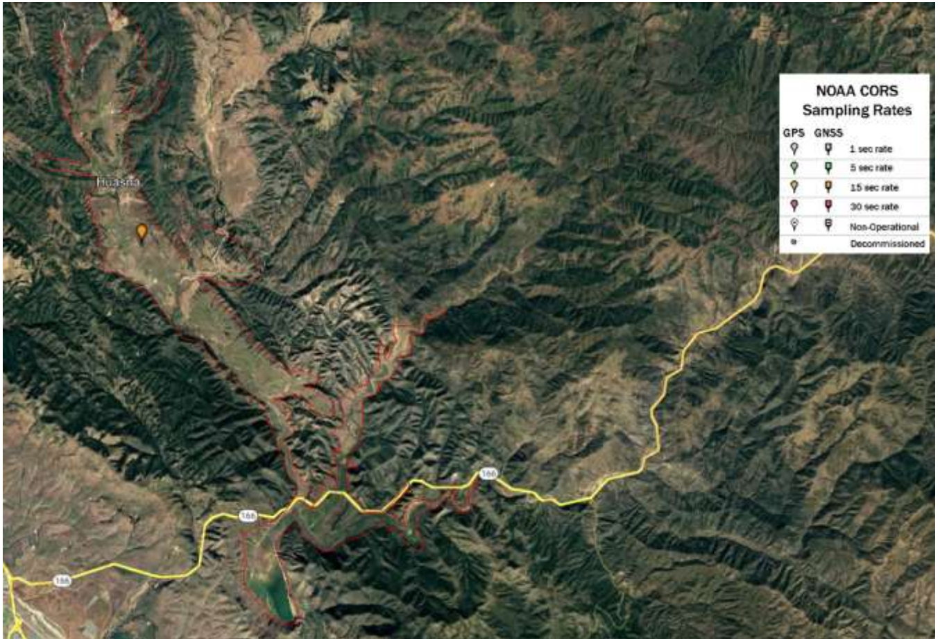
Figure 1 Polygon of AOI

The purpose of this project is to obtain the topographic of Twitchell Reservoir located in Santa Maria CA. We understand as well as the necessity to ensure you are given the most accurately collected data as possible.